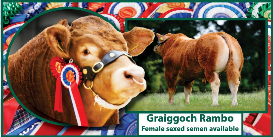
Graiggoch Rambo Female sexed semen available